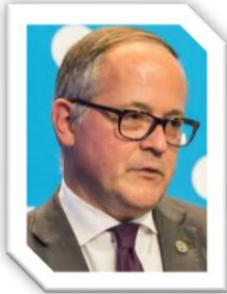
President of the Autorité de la concurrence (France)