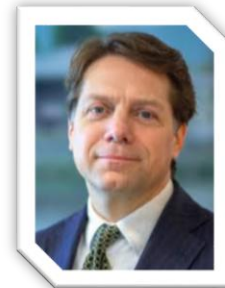
Chair, Netherlands Authority for Consumers & Markets

These interventions underscored the importance of maintaining strong competition principles while acknowledging the necessity of proportionate and context-sensitive implementation. The exchanges also highlighted the growing relevance of small economies in global discussions on economic resilience, sustainability, connectivity and innovation.