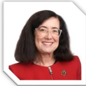
Chair, Australian Competition and Consumer Commission