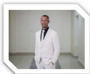
Director, Aruba Fair Trade Authority