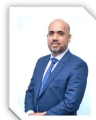
Executive Director, Competition Commission, Mauritius

Discussions addressed issues such as market concentration, transport dependency, vulnerability to external shocks, barriers to entry, and the challenges of maintaining effective competition in environments where rivalry may structurally remain limited.