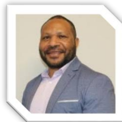
Commissioner & CEO, Independent Consumer & Competition Commission, Papua New Guinea